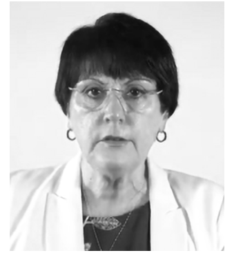
Dame Judith Hackitt

When the final report of Building a Safer Future was published in May 2018, I said that the system which covers construction product testing, information and marketing would require a map at least as complicated as the one we had developed to describe the regulatory system at that time. Although we were unable to extend the scope of that review to do such an exercise it was nonetheless clear that radical change was needed for Construction Products.